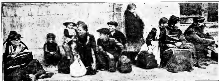
BELGIAN REFUGEES DRIVEN FROM THEIR HOMES BY THE WAR